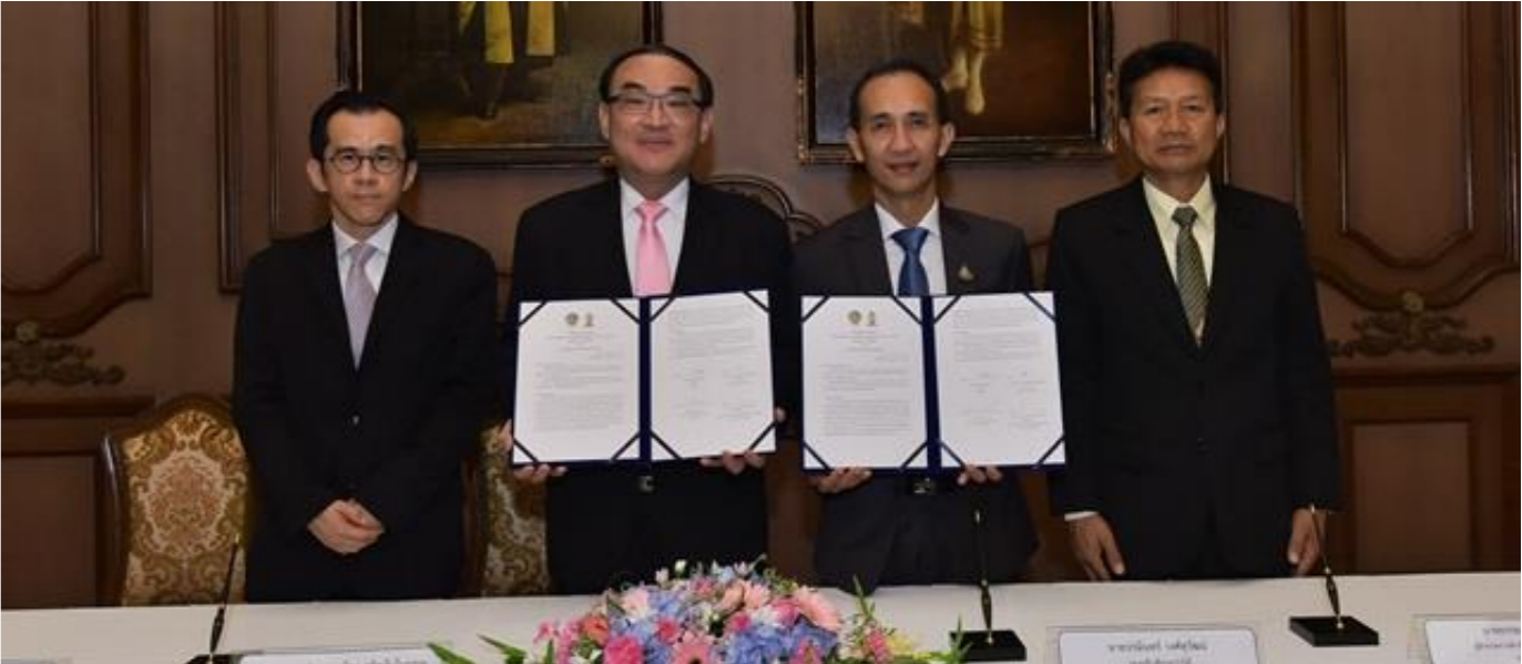
MOU with Royal Forestry Department 29 Oct 2019