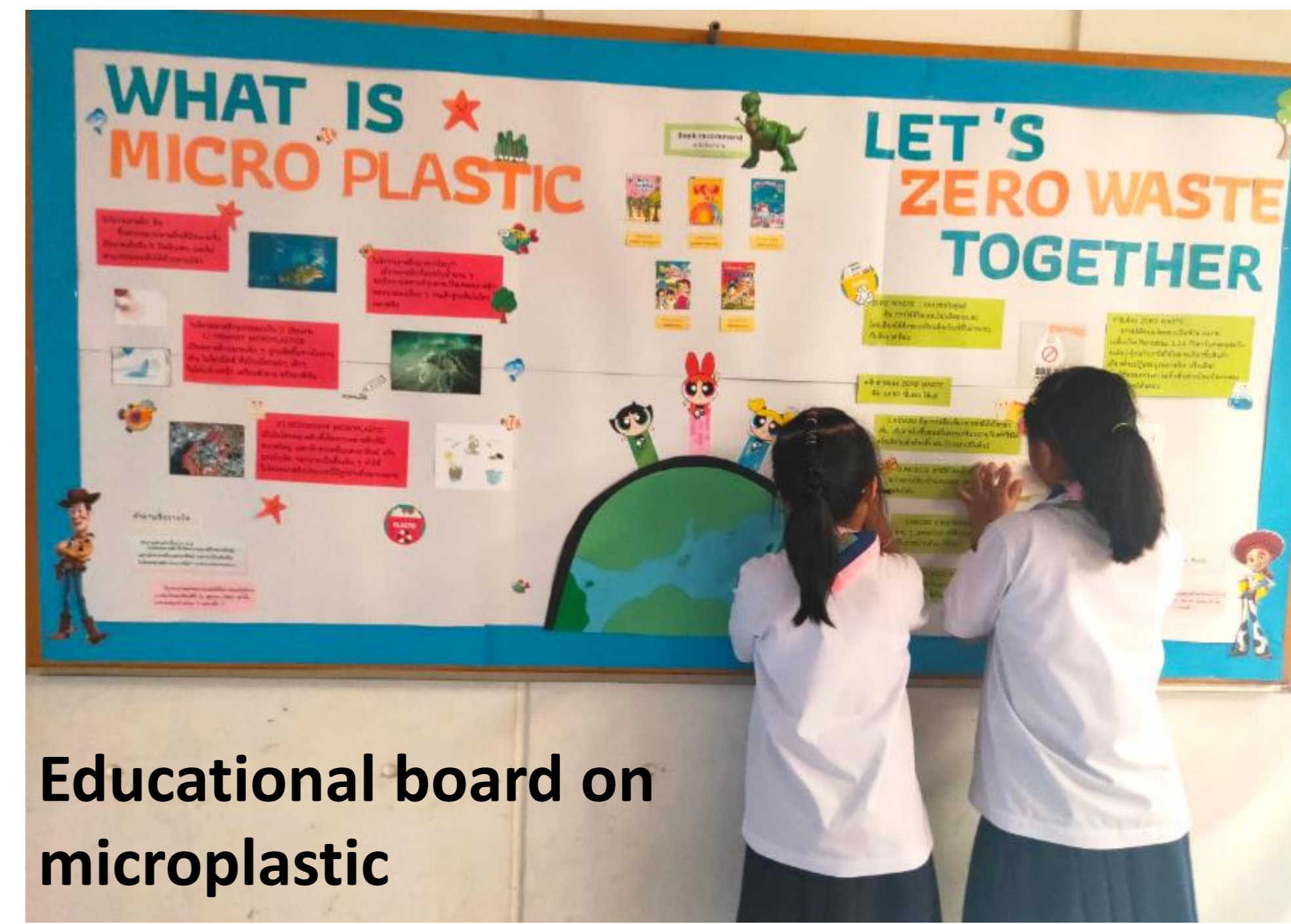
Educational board on microplastic