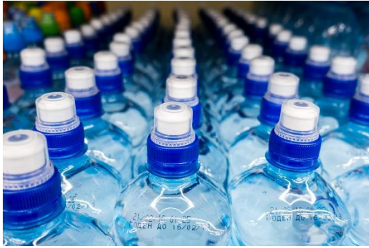
1. Ban Single Use Plastics And Plastic Tax