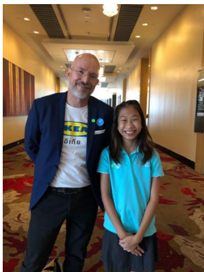
4. Green Brands