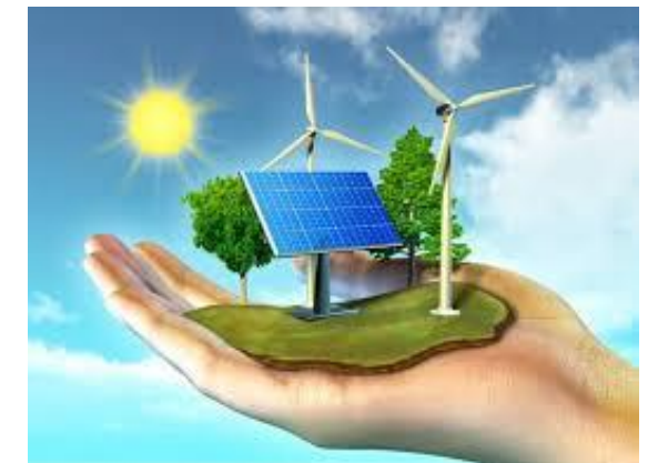
6. Renewable Energy