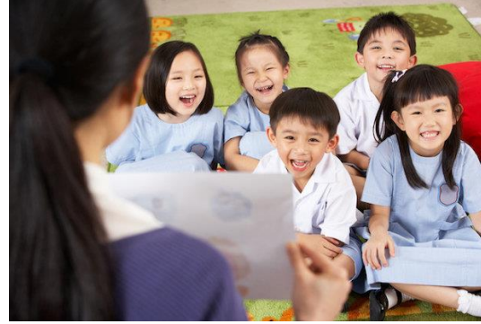
2 Eco Education in Thailand School Curriculum