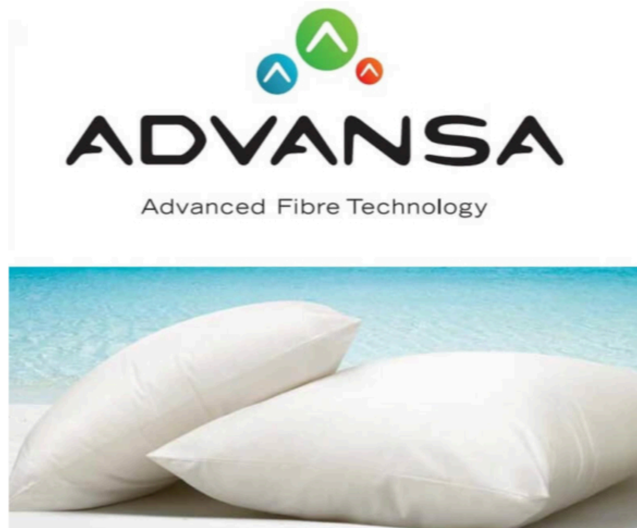
SUPRELLE® BLUE BY ADVANSA