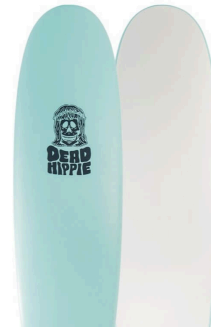
SOFT BOARDS SPOOKED KOOKS - AUSTRALIA