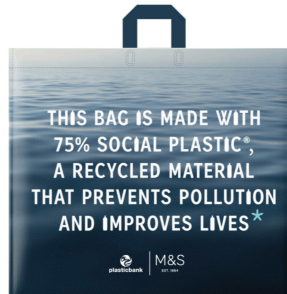
ECO-SHOPPING BAG MARKS & SPENCERS - UNITED KINGDOM